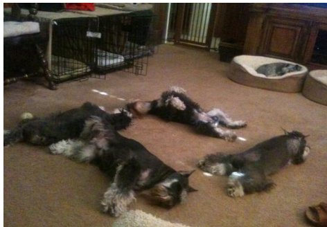
"Mini's Napping in a Square"